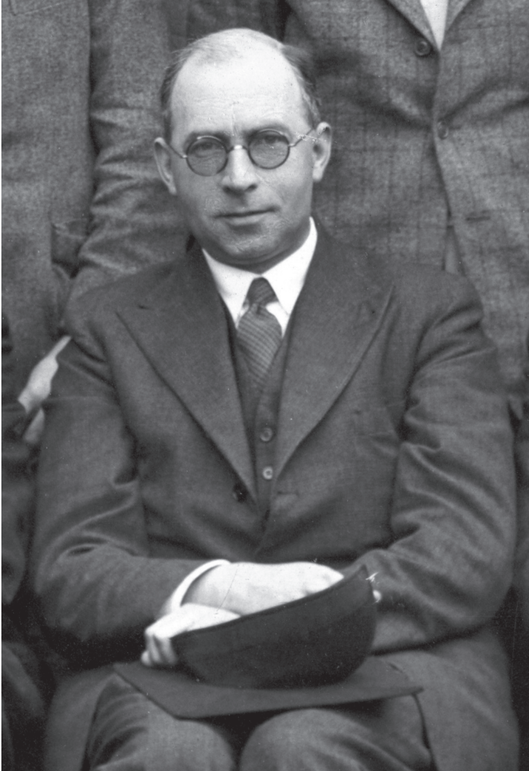
1. Syr / Sir J. Goronwy Edwards (1891–1976). Llyfrgell Genedlaethol Cymru / National Library of Wales